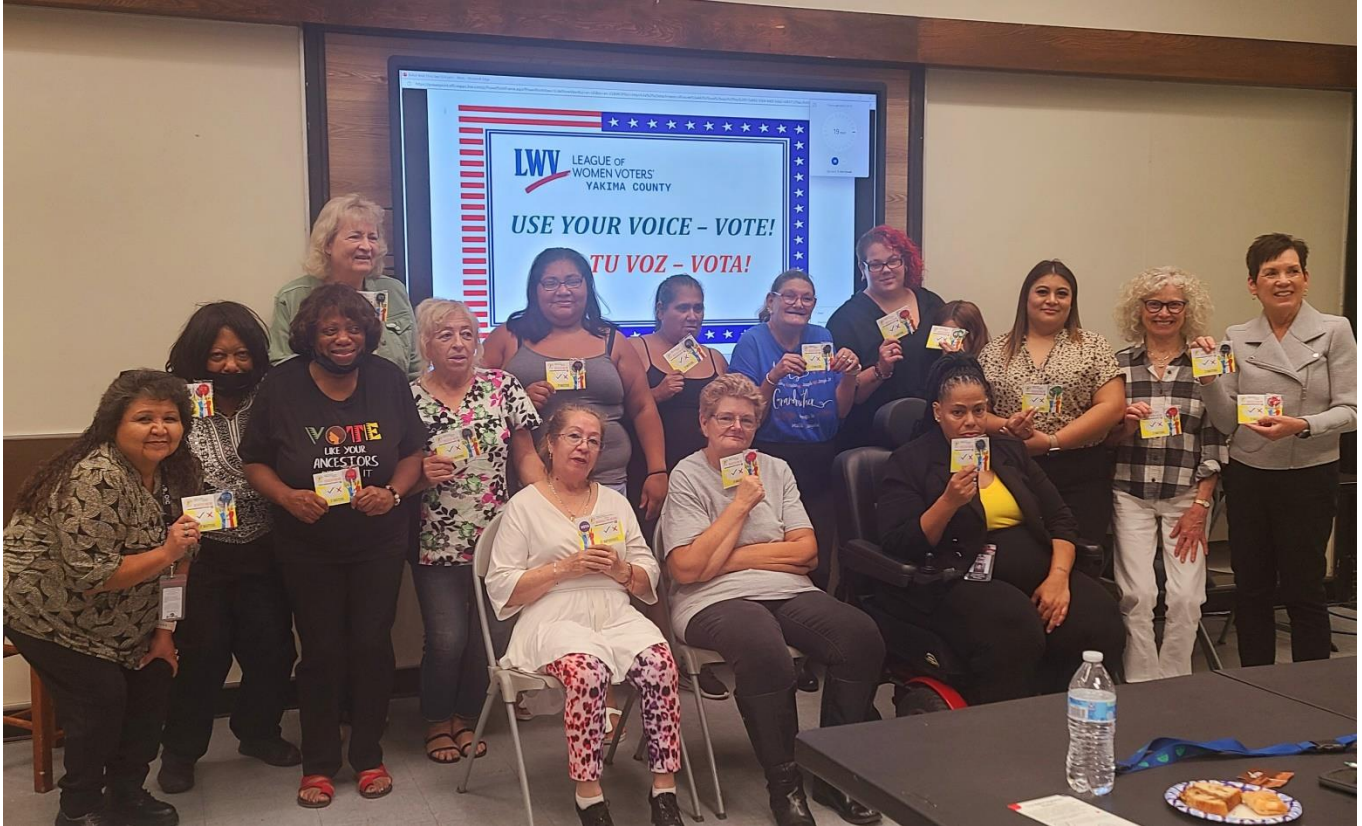
Figure 1 - Participants and volunteers OF THE Ballot Walkthrough partnership with OIC Senior Nutrition program.