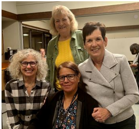
Volunteers with newly registered voter

This event was a collaborative effort between the League of Women Voters of Yakima County's Voter Services Committee and OIC of Washington's Senior Nutrition Program. The goal of the evening was to provide valuable voting and ballot information to the senior participants, either before or during their meal service. The League of Women Voters of Yakima County (LWVYC) shared information about the League's mission, offered guidance on voting procedures, and distributed additional community education materials.